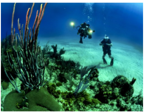
TRAVEL The Best Scuba Diving Locations in the World